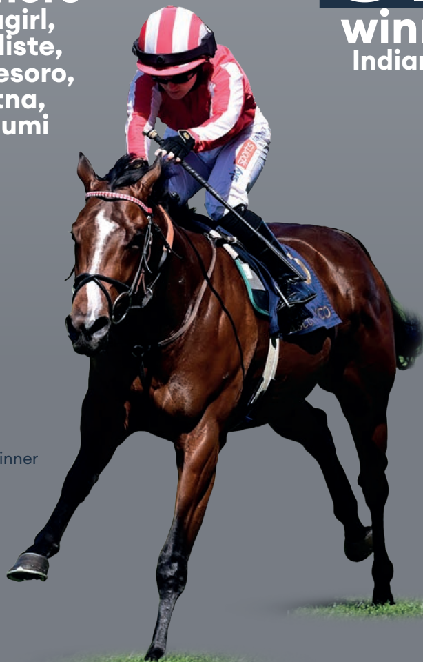
Bradsell Triple Group 1 winner

Attagirl, Fataliste, Mia Tesoro, Aetna, Kasumi