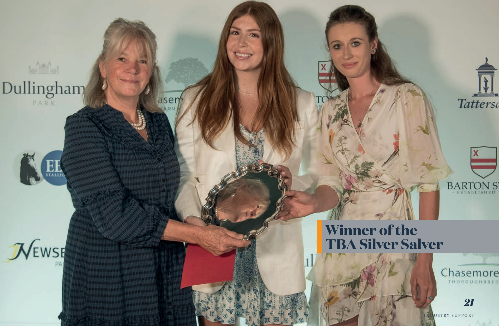
Winner of the TBA Silver Salver