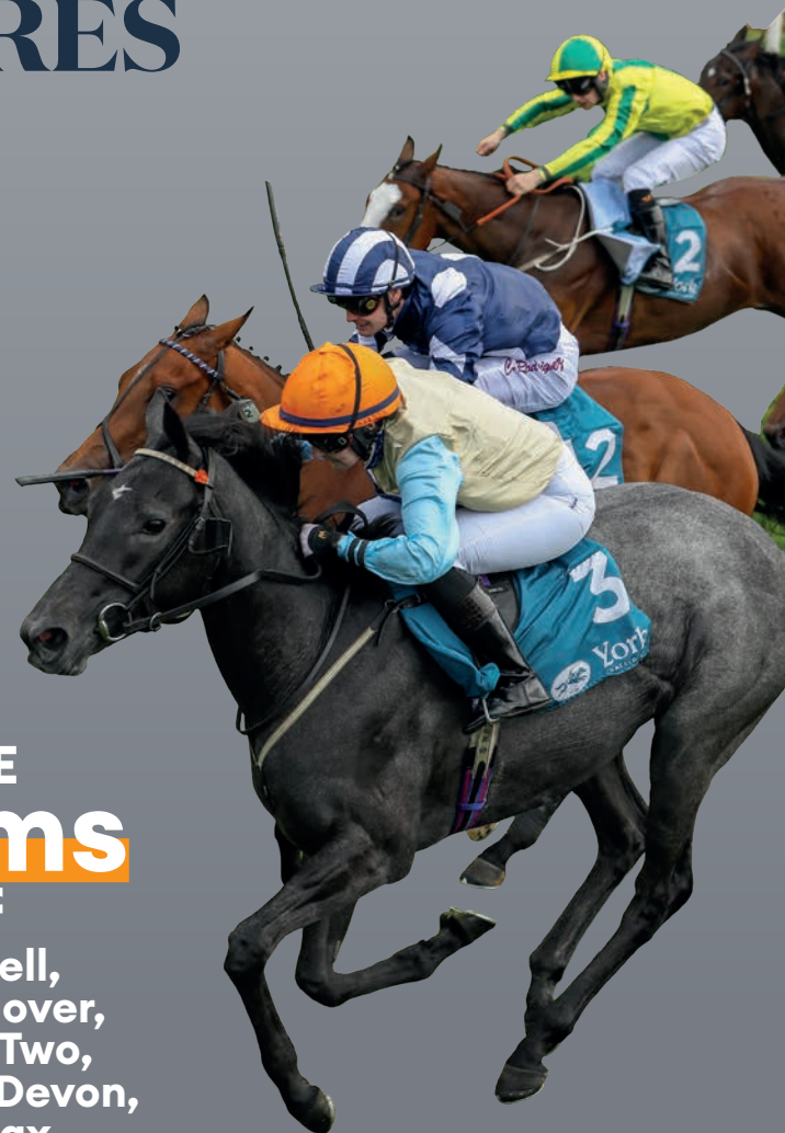
Betty Clover Listed Marygate Stakes winner

THE Dams of Bradsell, Betty Clover, It Ain't Two, Adalay In Devon, Ice Max